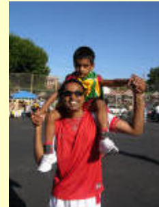
Singer Terry Gajraj takes time out with his son after performance