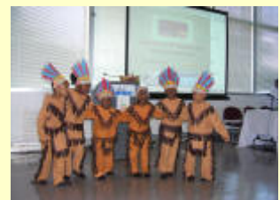
- in Amerindian sequence