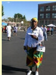
Guyana flags every which way