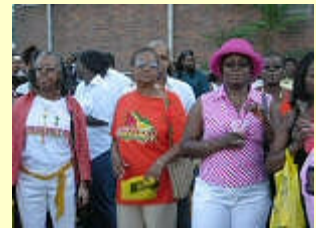
Crowd being entertained