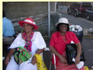
Old folks' day out