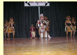
BHS African sequence at fun day performance