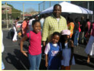
Dad showing kids a good time