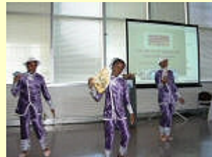
Little Impressions dance team perform at symposium