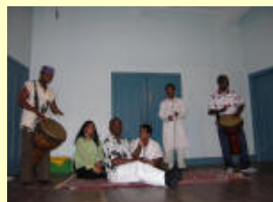
Great Drum beats in Richmond Hill Queens