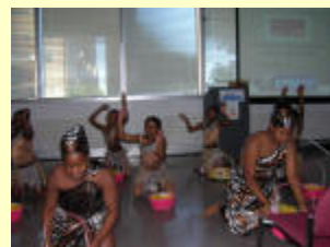
Impressions dance theatre in African sequence at Symposium