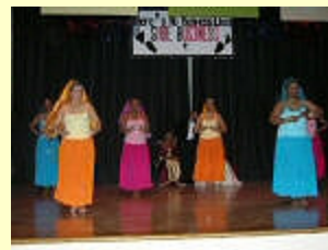
BHS Alumni performing Indian sequence at fun day