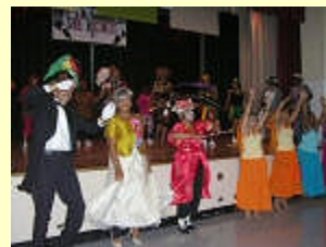
Bishops High School Alumni dance sequence finalé